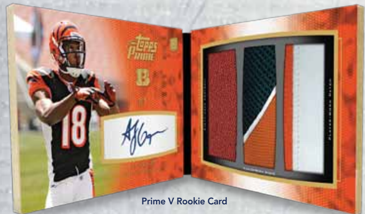
Prime V Rookie Card