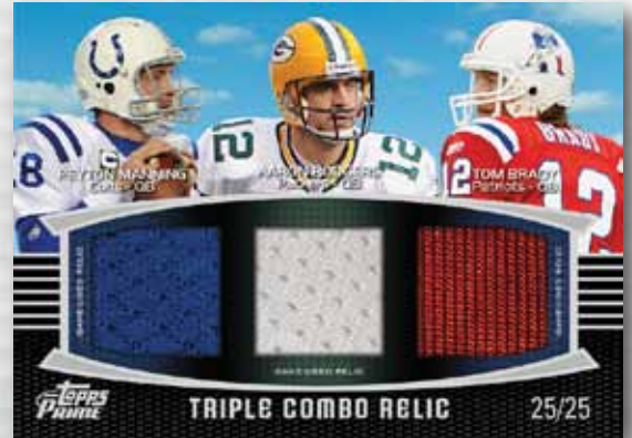
Triple Combo Relic Silver Parallel Card