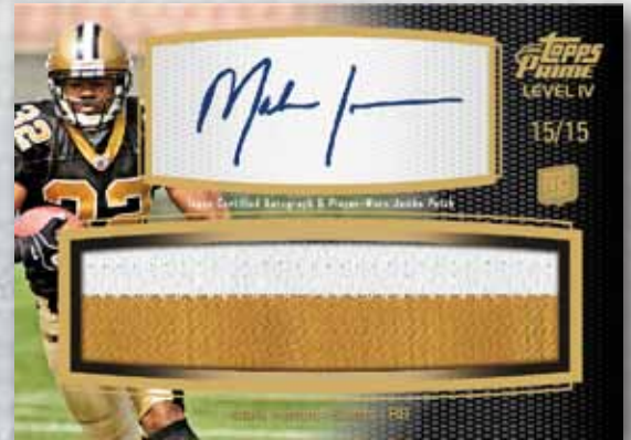
Prime IV Rookie Card