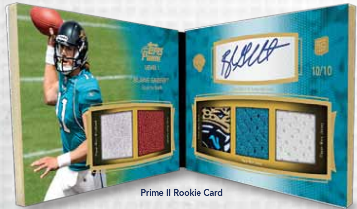
Prime II Rookie Card

NEW! Available in Hobby Exclusive Prime and Gold Parallels numbered ONE-OF-ONE and 25 respectively