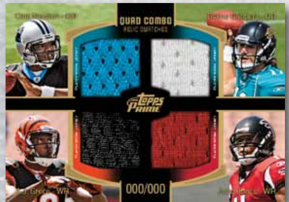
Quad Combo Relic Card