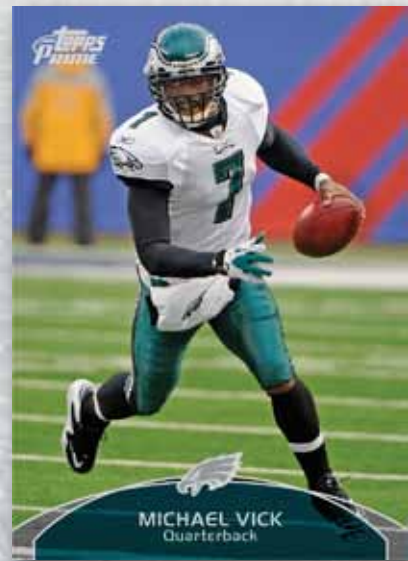
Veteran Base Card