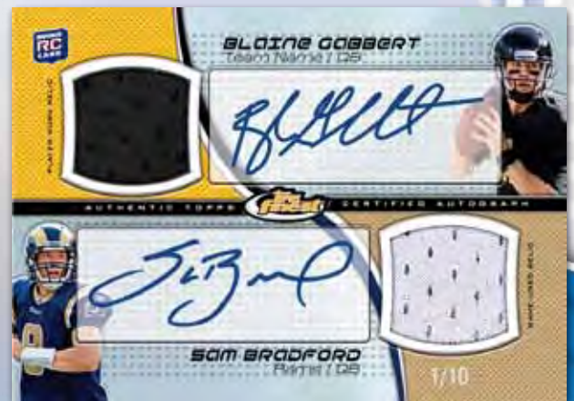
Dual Autograph Dual Relic Card