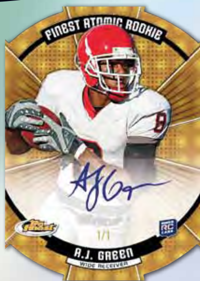
Rookie Finest Atomic Autographed Super-Fractor Superior Card