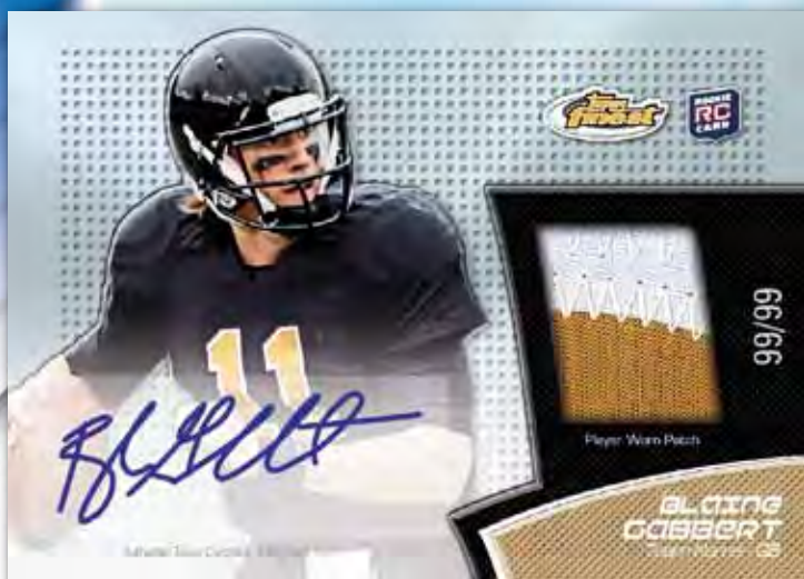
Rookie Autograph Refractor Patch Card

ALL ROOKIES WILL BE PICTURED IN NFL UNIFORMS