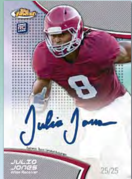
On-Card Rookie Autograph Red Refractor Card

Available in a 1/1 Super-Fractor parallel.