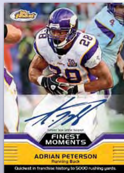
Finest Moments Autographed Card

GET THE FINEST THAT TOPPS & THE NFL HAS TO OFFER!